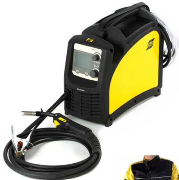
Supplied with shoulder strap.