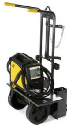
Trolley - for easier transport of gas bottle and Caddy® Mig.